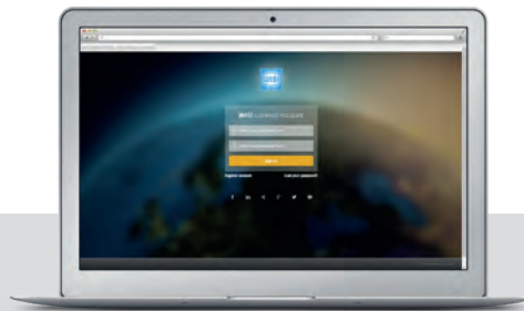
WISI Connect REGISTRATION & SUPPORT

In order to gain access to the WISI Configurator you need to register as a customer. You can do this at the WISI Configurator website.