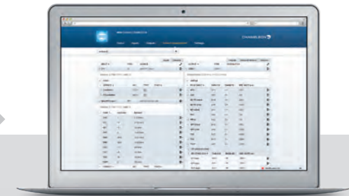
WISI Control CONTROL & MANAGEMENT

At the portal you can also download the entitlement file enabling your purchased software options.