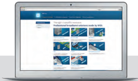
WISI Configurator SELECTING SOFTWARE

The WISI Configurator is an online tool to help you select and order the optimal software options for your particular installation.